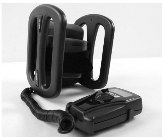
Fig. 2. Modern bone growth stimulator.

This device is an example of an early pulsed electromagnetic field technology that was used for therapeutic heating of tissue. This device was developed and sold by Fischer & Co in the early 1920's.