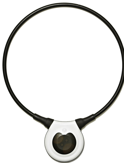
Fig. 3. Targeted pulsed electromagnetic field device.

The growing body of research and clinical evidence supporting PEMF therapy in the 1980's and 1990's also fostered greater understanding of mechanisms of action (Pilla, 2006). Scientists began to develop PEMF devices with waveforms designed, a priori, to modulate specific biological processes. For example, one device termed “targeted PEMF” was successfully developed to reduce inflammation and has become a FDA-cleared therapy for treating postoperative pain and edema (Fig. 3) (Pilla, 2013). Non-targeted PEMF systems, also readily available, were not specifically configured to a known biological target, and thus demonstrated a wide range of technical specifications and