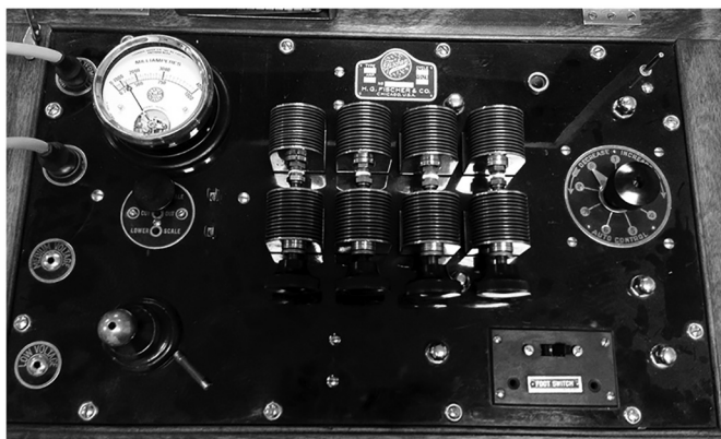
Fig. 1. 1920's era fischer diathermy machine.

This device is an example of an early pulsed electromagnetic field technology that was used for therapeutic heating of tissue. This device was developed and sold by Fischer & Co in the early 1920's.